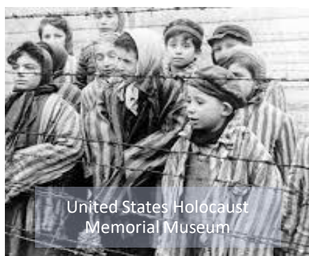
United States Holocaust Memorial Museum