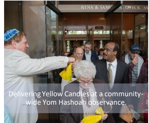
Delivering Yellow Candles at a community-wide Yom Hashoah observance.

FYI: Some candles cannot be delivered because of gated communities and security buildings. Ask your volunteers to bring those back. In turn, mail those Yellow Candles that could not be hand-delivered or make other arrangements with the recipient.