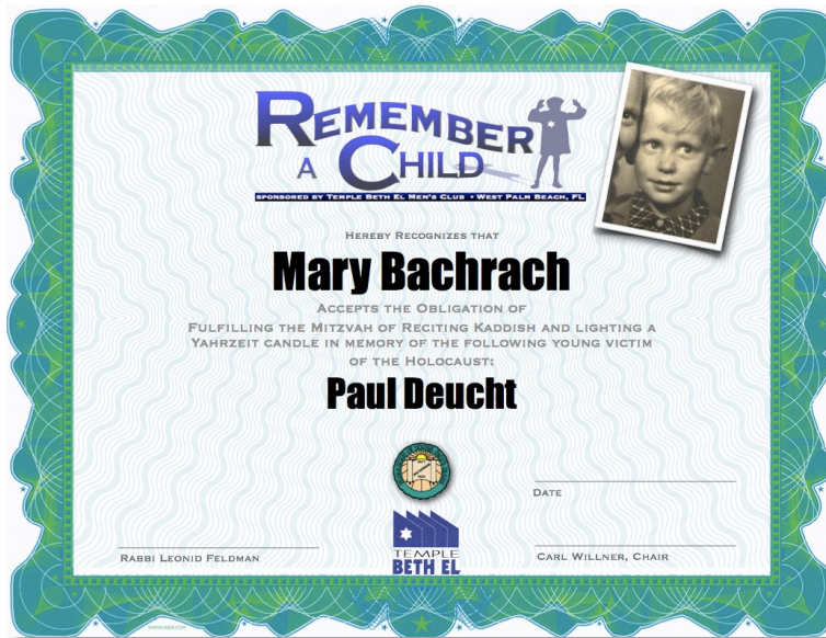
Sample certificate (reduced size)