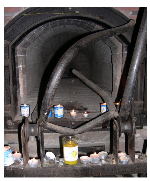
Glass Yellow Candle<sup>TM</sup> at Auschwitz oven