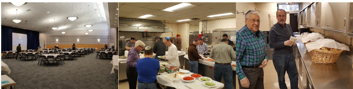
Above Left – The Room Set-up for 250 is Now Complete, Center – A Flurry of Activity in the Kitchen Getting the Meal Ready, Right – Bagels and More Bagels Ready to Put Out

This is the largest program we work on each year with 250 attendees. The Men’s Club participates in the program prior to the introduction of the special speaker and of course as with all programs we provide our buffet breakfast. Unlike our smaller programs, this program enlists 30 men to do the room set-up, prepare the food, set-up, and man the three separate buffets and of course breakdown and cleanup at the conclusion of the event. Please see the Program series flyer attached under “Marketing”.