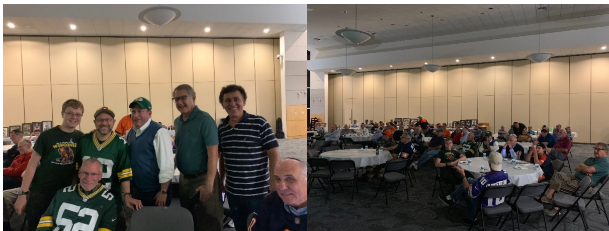
Above Left – Our Packers Contingent at Beth Shalom, Right – Time to Watch the Game