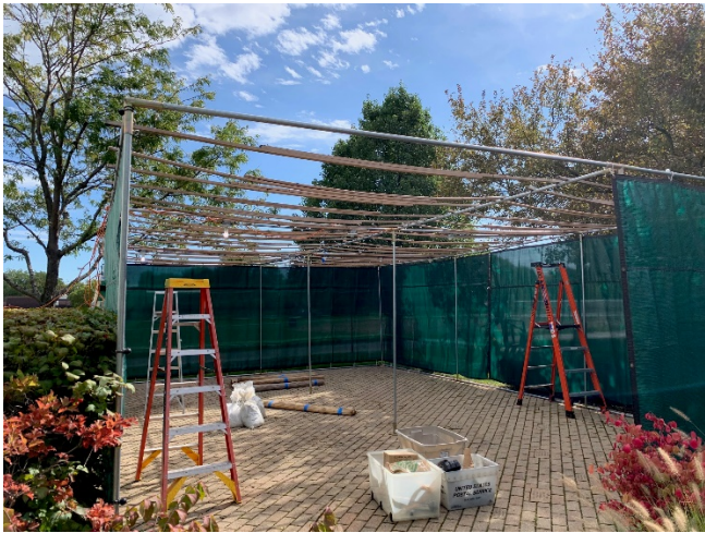
The Congregational Sukkah Under Construction

This is a great shared work experience for club members of all ages. Each year all attendees are treated to the traditional Men’s Club buffet breakfast.