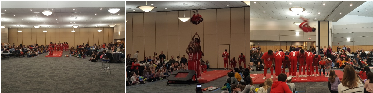
The Main Attraction, The Jesse White Tumblers