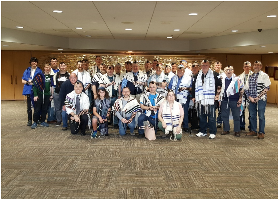
Above – World Wide Wrap Participants after the Service