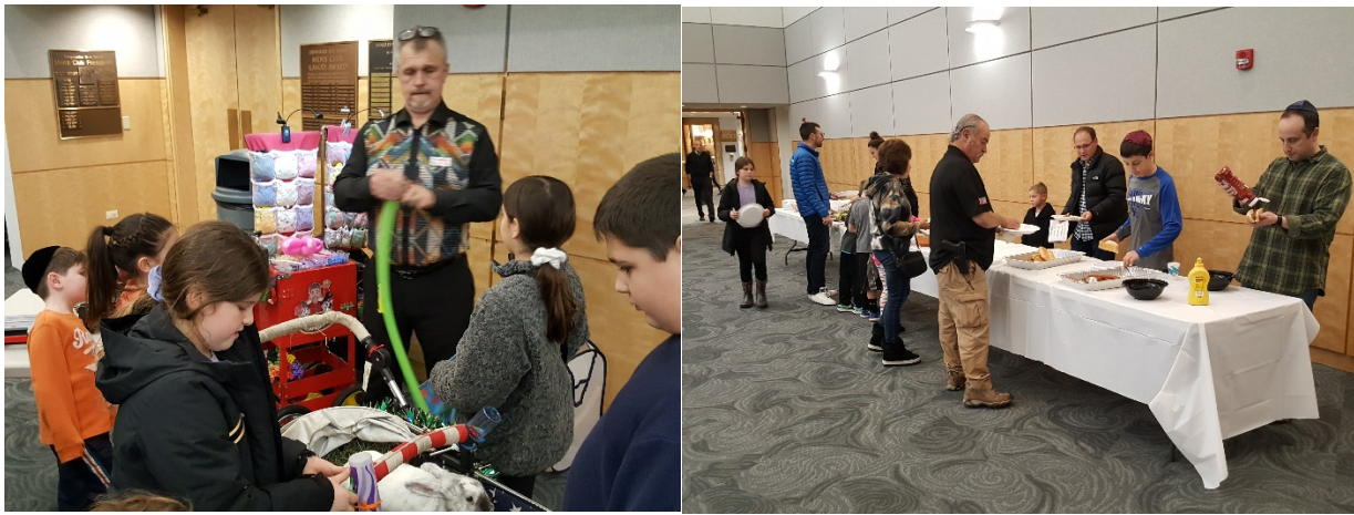
Above From the Left- Balloons for Everyone and Dinner is served