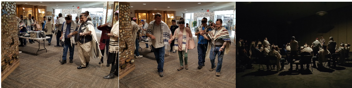
Above – Blindfolded and Escorted into the Service and During the Service

Parallel to this program, the Men's Club sponsored the "Build a Pair" program in our school for all age-appropriate students and their parents. Please see the Program series flyer attached under "Marketing".