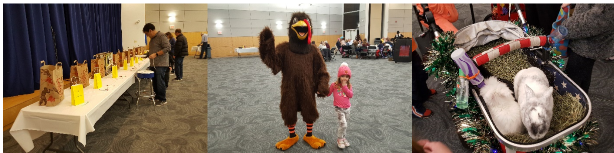
Above From the Left- The Raffle Sees Action, The Turkey Arrives! and Everyone Loves the Bunnies

The flyer for this Program is attached under “Marketing”.