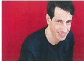
DAN NATURMAN As seen on Tonight Show, Letterman, Jimmy Kimmel and at clubs across the US!