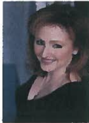
SHERRY DAVEY The International Comedy Diva! The Queen of Fashion & Comedy! Born in NJ...raised in England!